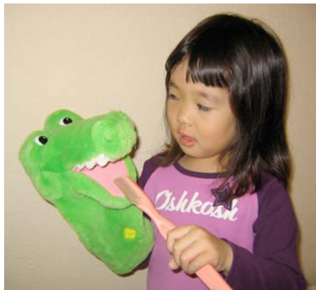
Dudley having his teeth brushed by a Kindergarten student.